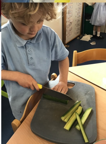
Cooking up some Coronation banquets and tea parties in Buttercups & Poppy!